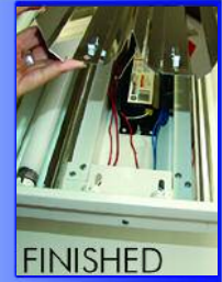
FINISHED Step 3. Pull cover up & expose wireway