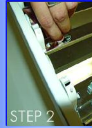
STEP 2 Step 2. With hands at each end pinch