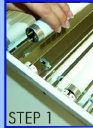
STEP 1 Step 1. Remove two center lamps